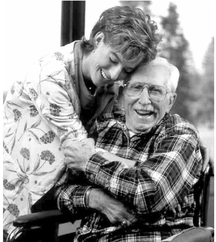
Long-term care providers are at the front line of supporting our nation's aging population.

This project is jointly sponsored by the Benedictine Health System, the American Health Care Association and the Minnesota State Colleges and Universities system through its online education portal, Minnesota Online, and its Healthcare Education Industry Partnership. The project will develop and deliver online courses to