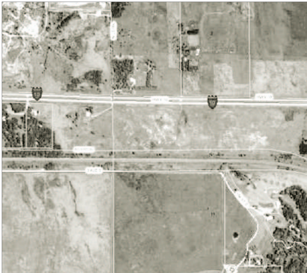
This aerial photo shows the Regional Science Center, part of the Minnesota State University Moorhead, located at the end of a gravel road that is in serious disrepair and often impassable. The center is at the bottom right of the photo, above.