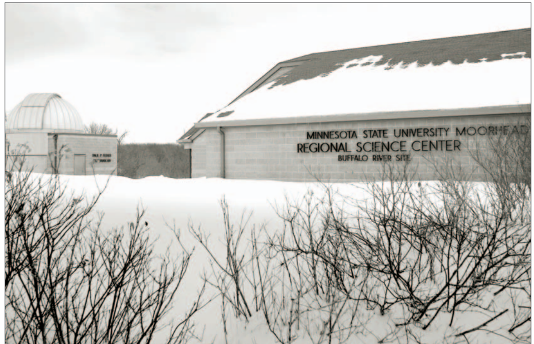
The road leading to the Minnesota State University Moorhead Regional Science Center is in serious disrepair.

The road is difficult to use, particularly during wet conditions, because it is