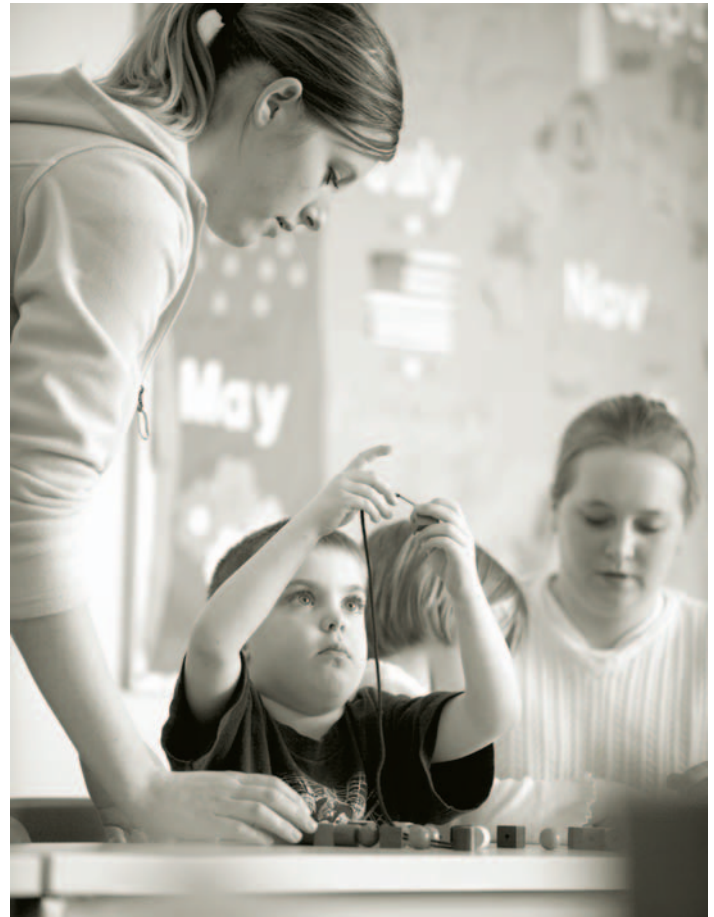
Community-based learning will be integrated into the existing health care curriculum to increase outreach to families in south-central Minnesota.

The university, together with its partners, will establish a center to provide rural and immigrant populations with access to education, job training, career services and health information in the allied health domains. A health and information network will be