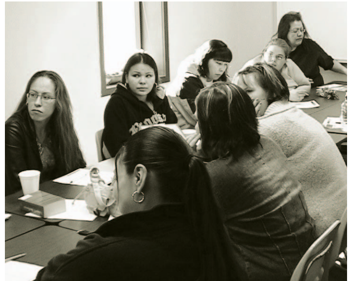
Experiences with democratic and legal principles are planned to help encourage a new generation of talented young people become leaders.

Educational and legal professionals and support staff will help mentor 200 young Native Americans in a series of sessions largely housed at Northwest Technical College and Bemidji State University. They will travel to various venues in the Minneapolis and St. Paul area, including the State Capitol, the State Supreme Court and a metropolitan law school. They will visit with all levels of state public officials, tribal police, tribal courts and law enforcement experts.