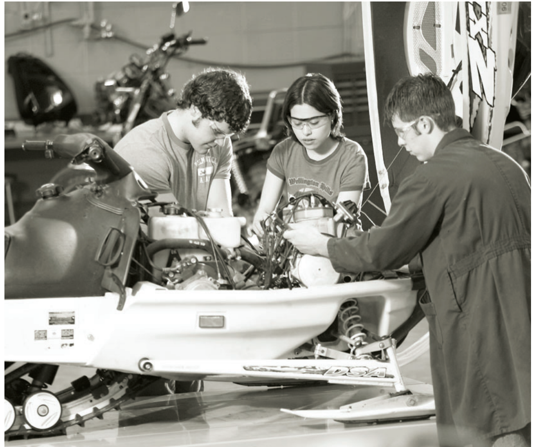
Education and training services are provided by Minnesota State Colleges and Universities to rural Minnesota companies like this recreational vehicle manufacturer.

The project was launched successfully in 2003 as an education, training and workforce response to the exponential growth of the information technology marketplace worldwide. Participants in regional planning meetings included the Northeast Higher Education District, communities, businesses, economic development