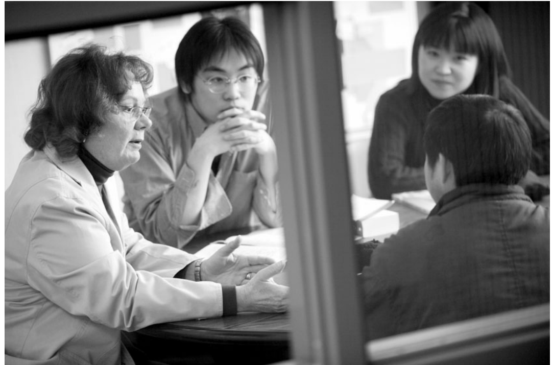
An influx of immigrants is placing new demands on colleges to help with English language learning programs.