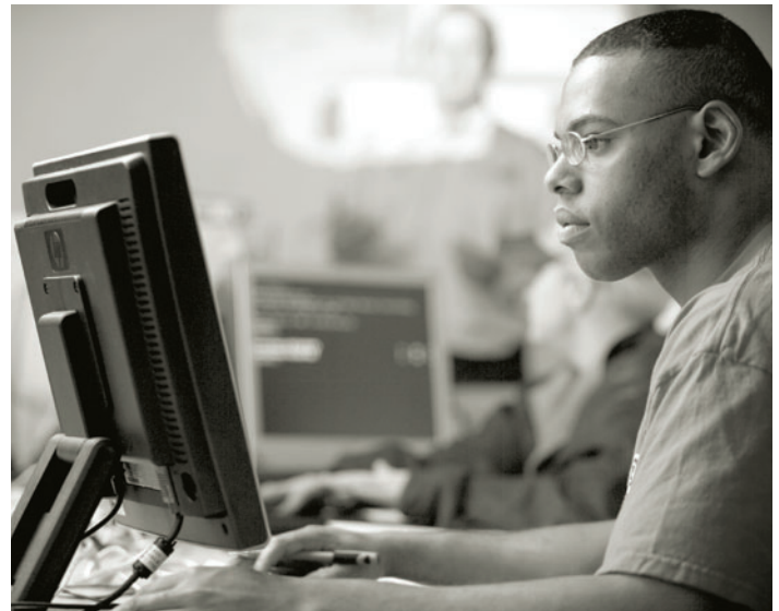
Through hands-on experiences, students learn to identify and address simulated penetration threats and network vulnerabilities.

The Center for Strategic Information Systems and Security was created recently at Metropolitan State University with Minneapolis Community and Technical College and Inver Hills Community College. The center is one of four Centers