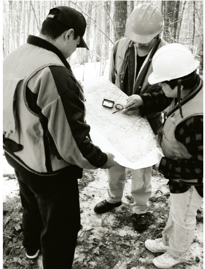
An American Indian collaboration with Bemidji State University and Northwest Technical College will include training programs in nursing, gaming and construction.

Northwest Technical College, Minnesota State Community & Technical College at Detroit Lakes and Bemidji State University will support this collaborative by