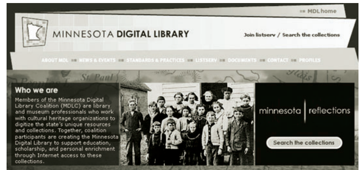
The Minnesota Digital Library has launched its first collection, "Minnesota Reflections," with more than 5,000 images created before 1909.

The target audiences for the Minnesota Digital Library