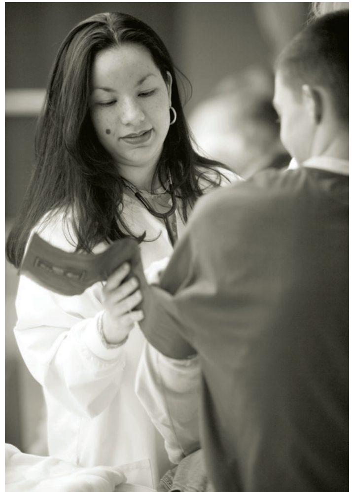
Bemidji State University proposes a new four-year degree program to help fill the region's need for nurses.

The university also has a history of delivering strong American Indian and rural health issues education in its nursing curriculum and of having excellent relationships with area bands and American Indian public health care agencies and other public health programs.