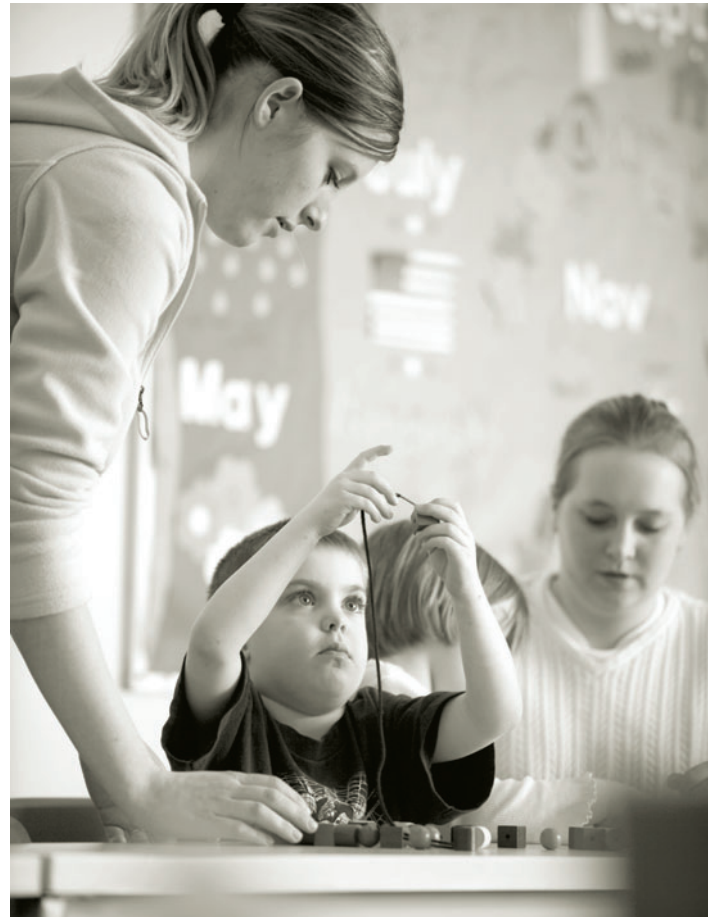
Community-based learning will be integrated into the existing health care curriculum to increase outreach to families in south-central Minnesota.

The university, together with its partners, will establish a center to provide underserved and disadvantaged populations